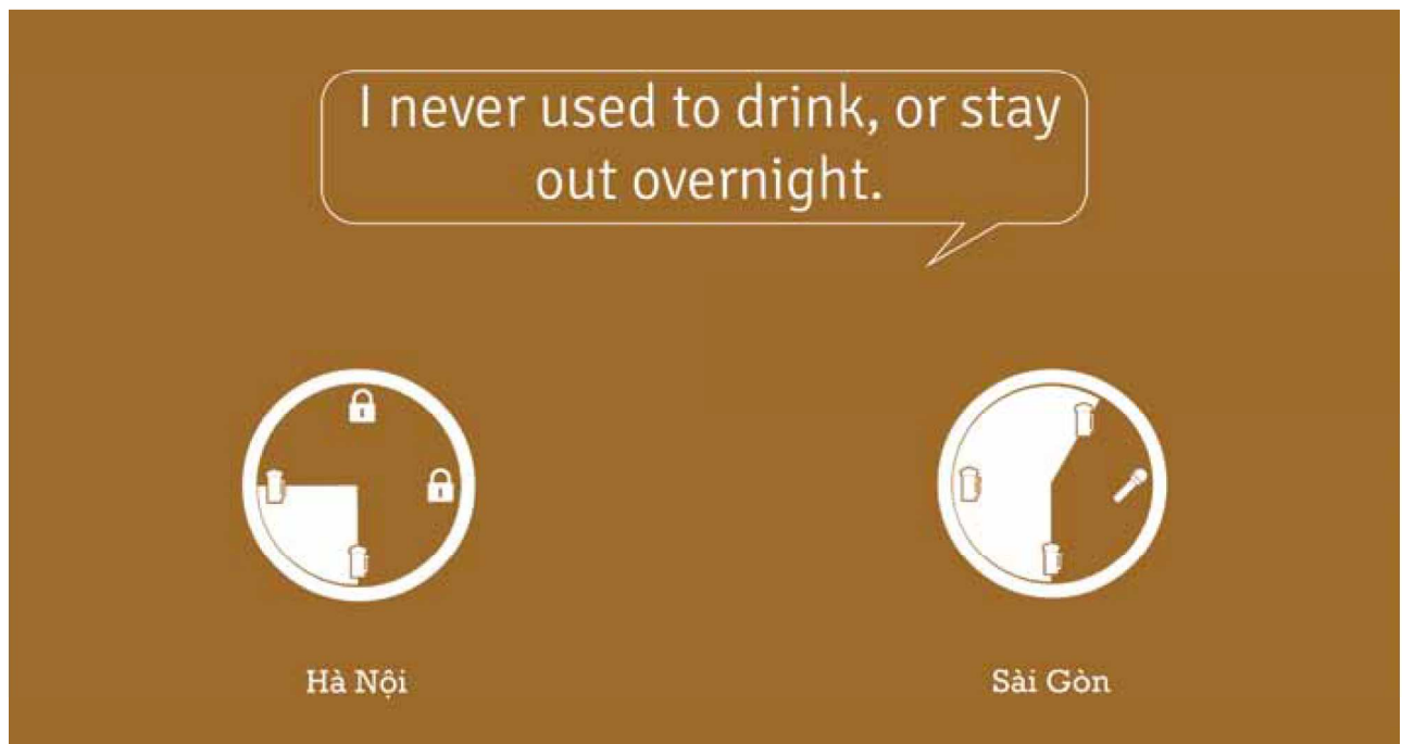
"In the north, we go home early to be with our families, but here, people like to stay out to the early morning hours."