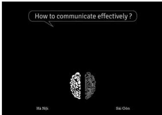
"People in the north are more flowery in their speech, while Saigonese are straight talking."