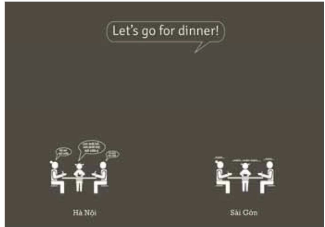
"In Hanoi, the custom is to wish someone a good meal before eating. In Saigon, you just dig in."